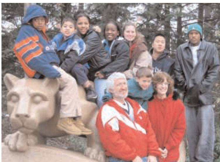
Visiting Pennsylvania for Thanksgiving

It may have been hard to tell but you truly are important to us. Your friendship, love, prayers, and gifts mean more than we can say.