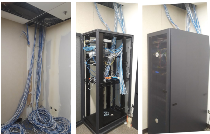
Fountain of Wires