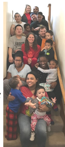
Annual Christmas photo on the stairs