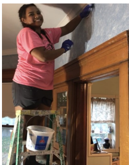
Rachel rag painting dining room

We enjoyed the shades of paint chips when selecting “blues” after repairing old ceilings and wood flooring and then painting a bedroom and the dining room.